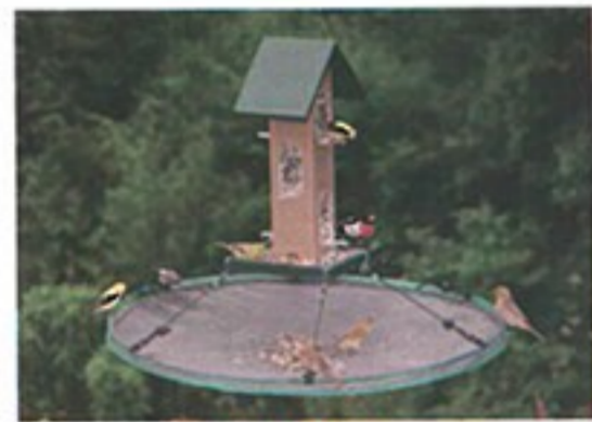
SEIA13921 30" Seed Hoop

Cardinals prefer Black Oil Sunflower or Safflower, or a mixture of both. The Cardinal's large bill also allows them to crack open the larger striped sunflower seeds. Save more seed with Songbird Essentials Seed Hoops.