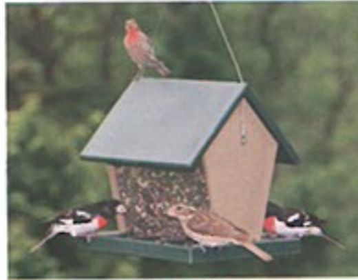
SERUBHF75 Large Hopper Feeder

Cardinals are "ground" feeders; however, they will feed on flat surfaces. Wood platform feeders (hopper, fly through and open platform) placed five feet or so above ground level are ideal to attract them. Note that the perches on most tube feeders are too small to allow Northern Cardinals to comfortably feed. To attract Cardinals you must attach a tray, and we have a tray for nearly every tube feeder!