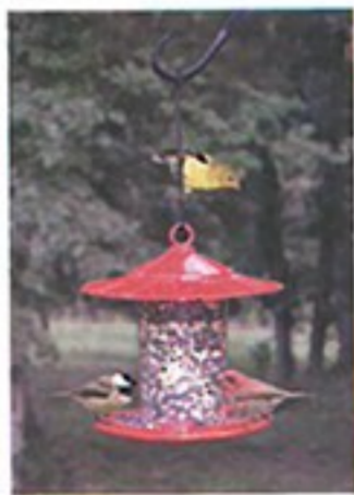
SE946 Dial-A-Seed Feeder

The Cardinal is really not a hard bird to please. Provide his favorite seeds and the Cardinal will often be your first bird to feed in the morning, and the last at night. In the Spring, you'll enjoy seeing the male Cardinal offer the female a carefully selected seed as part of their "Mate feeding Ritual."