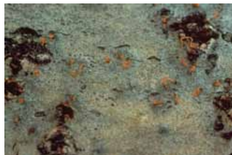
Figure 3: Orange spores oozing from pycnidia.