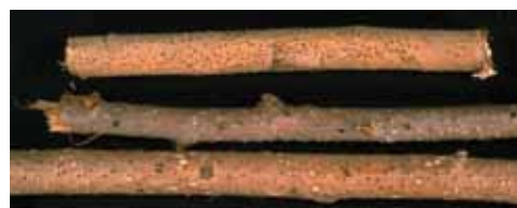
Figure 2: Cytospora canker on three branches, each with scattered pycnidia.