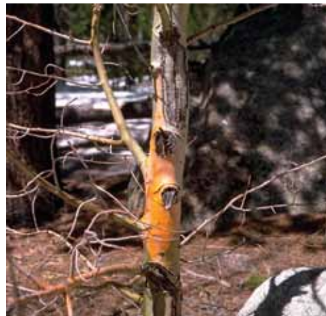
Figure 1: Orange discoloration found in spring and early summer associated with cytospora canker.

be evident (Figure 2). The pimples are the reproductive structures of the fungus. Under moist conditions, masses of spores (seeds) may ooze out of the pimples in long, orange, coiled, thread-like spore tendrils (Figure 3). Reddish-brown discoloration of the wood